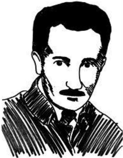
Martin Heidegger (1889-1976)