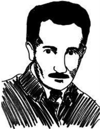
Martin Heidegger (1889-1976)