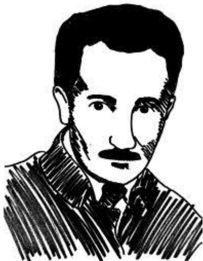
Martin Heidegger (1889-1976)